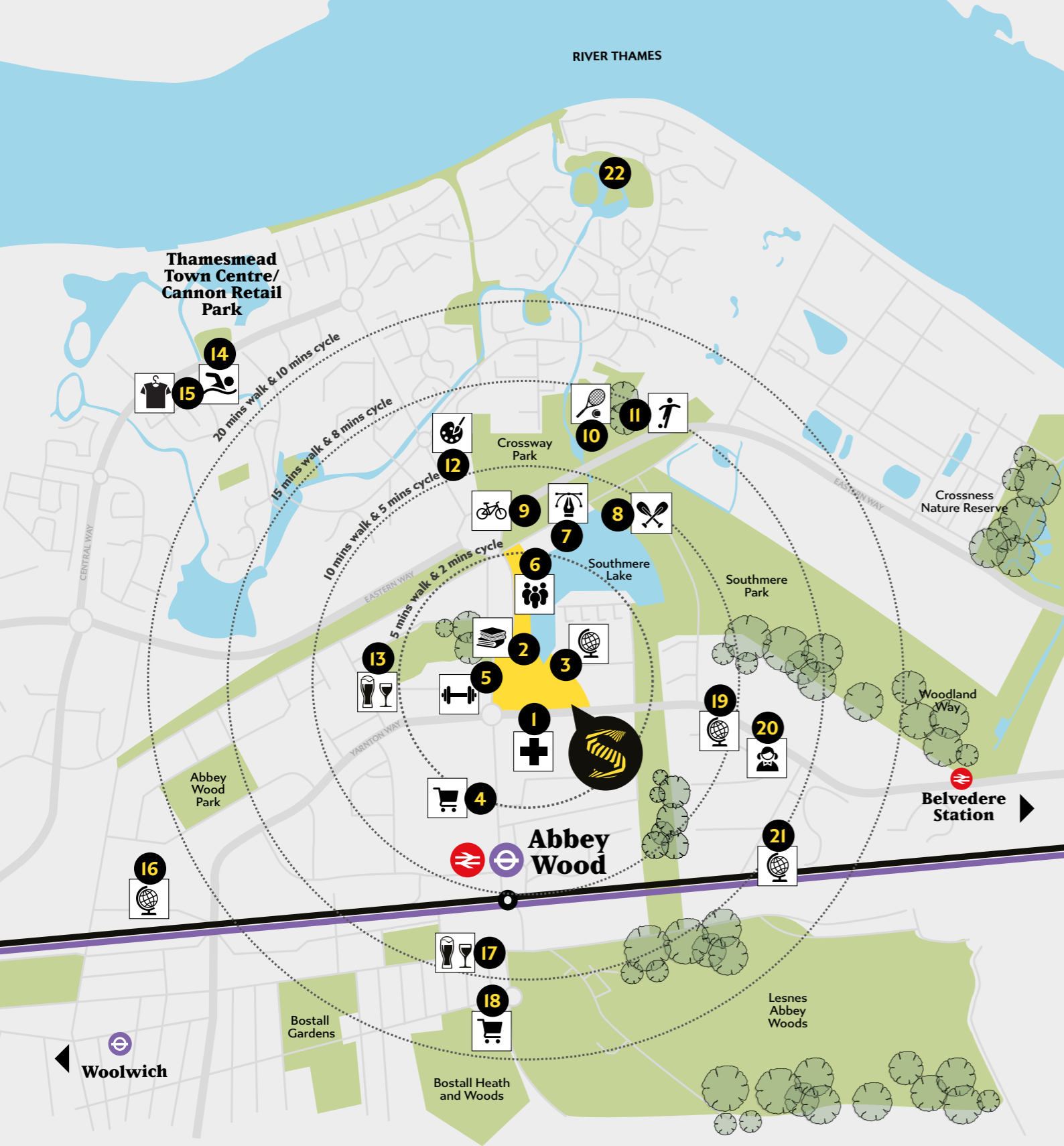
Map not to scale. Walking and cycling times are approximate only.